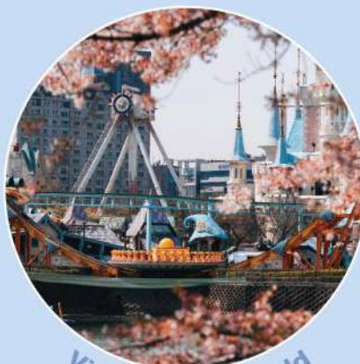
Visit to Lotte World