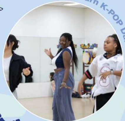
Learn K-POP Dance