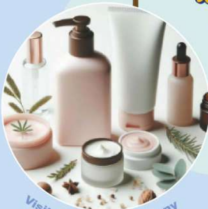
Visit to Korean Company