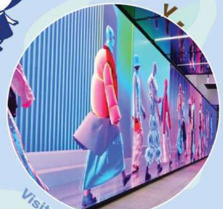
Visit to Hikr Ground