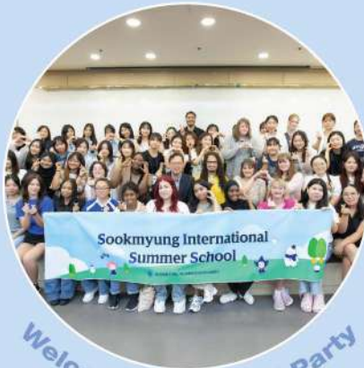
Welcome & Farewell Party