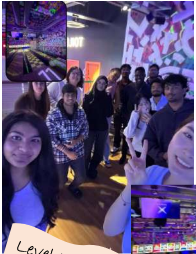
Level x- Bowling

Whilst we encourage students to explore the UK during their stay FREE Social activities will be arranged to help showcase our beautiful region!