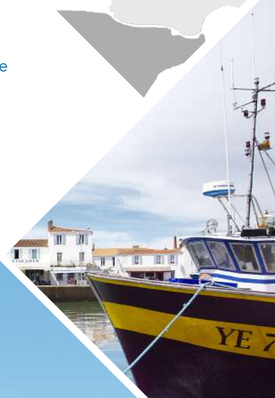
Les Sables d'Olonne