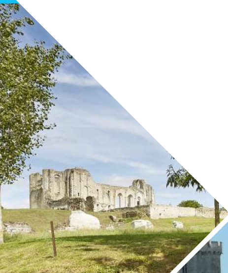
Maillezais, Ancient Abbey